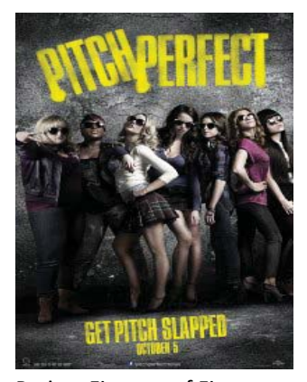
Rating: Five out of Five stars